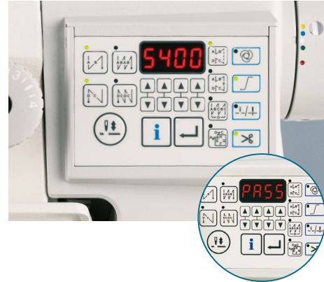
Provided with a password lock function

Compared with conventional V-belt driven sewing machines, sewing machines driven by direct drive motors save more than 13% of power consumption.